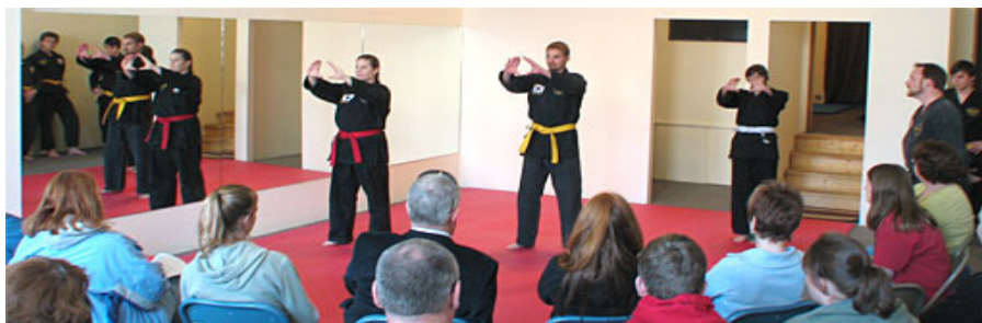
STUDENTS DEMONSTRATE A READY POSITION IN HAPKIDO DURING THE DEMONSTRATION (PHOTOGRAPH BY A. HUDSON OF PLATTSMOUTHSQUARE.COM)

(PHOTOGRAPH BY A. HUDSON OF PLATTSMOUTHSQUARE.COM)