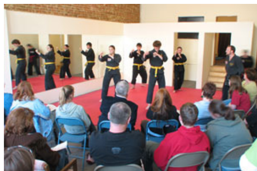
CURRENT HAPKIDO STUDENTS DEMONSTRATING A FIGHTING STANCE AND KICKING TECHNIQUES.